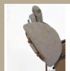
2L-A-SD Lateral Support (Must choose fabric option*)