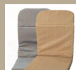
2C-CU Cushion (Must choose fabric option*)